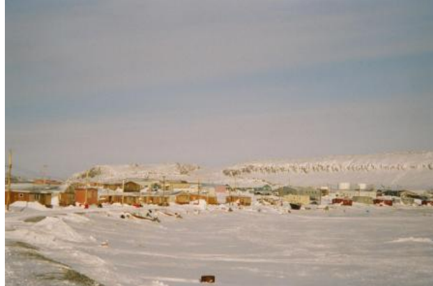
Photos of Ulukhaktok

AINA ArcticCouncil ArcticNet ACUNS ARI CAPP CARC CCI CCG CEAA ConocoPhillips BDEC DFAIT DFO DND EC CPAWS EISC EIRB FJMC GNWT IC WMAC-NS GNWT-ITI